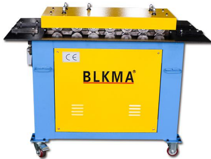
Round Duct Lock Forming Machine